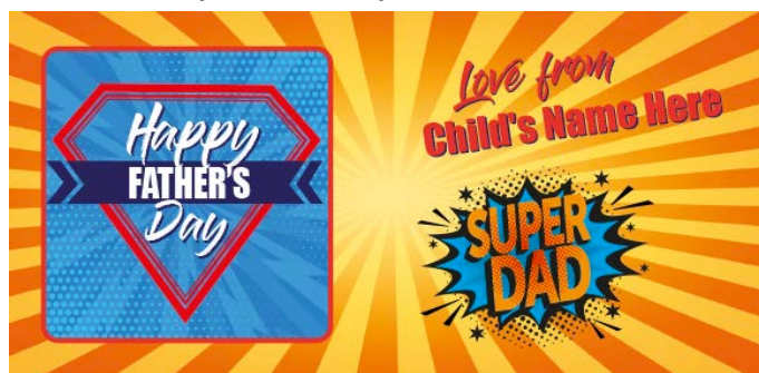
Child's Name is printed on chocolate bar wrapper