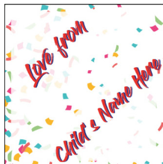
Child's Name is printed on top of cube