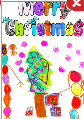
The wording will be cut off.