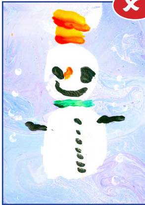
Original design using pastel colours.