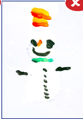
The pastel colours will print like this.