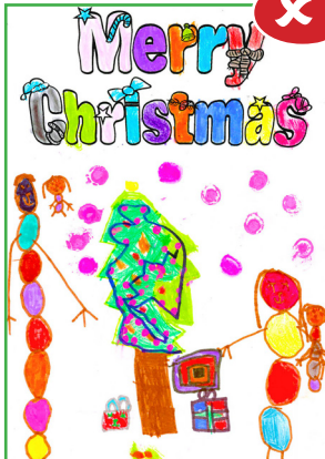
Original design with important wording close to the edge.