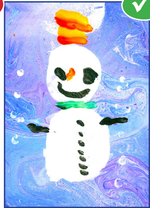
SOLUTION Use bold colours for backgrounds.