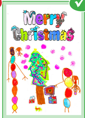
SOLUTION Keep a clear edge around the design, please note any borders drawn will be shown on the final design.